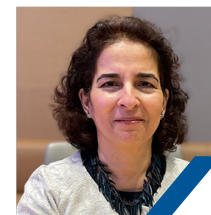
NAZILA GHANEA Special Rapporteur on Freedom of Religion or Belief, United Nations