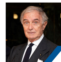
H.E. COUNT RICCARDO PATERNÒ DI MONTECUPO Grand Chancellor of the Sovereign Military Order of Malta