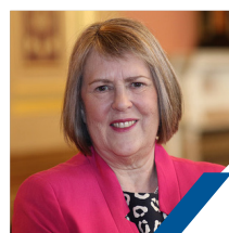
FIONA BRUCE UK Prime Minister's Special Envoy for Freedom of Religion or Belief, UK