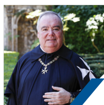
HMEH FRÀ JOHN T. DUNLAP The Grand Master of the Sovereign Military Order of Malta