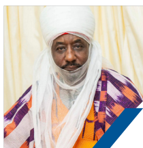
HH KHALEEFA MUHAMMADU SANUSI II

Global Director for Religious Engagement, Search for Common Ground, Jerusalem, Israel