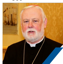
ARCHBISHOP PAUL RICHARD GALLAGHER Secretary for the Relations with States, Secretariat of State, Holy See