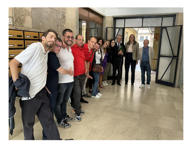
Prima visita dei ragazzi ai locali sede del Progetto